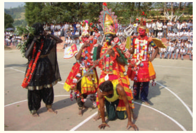
The Department of Sports and Youth Affairs, Arunachal Pradesh in collaboration with Union Ministry of Youth Affairs and Sports,